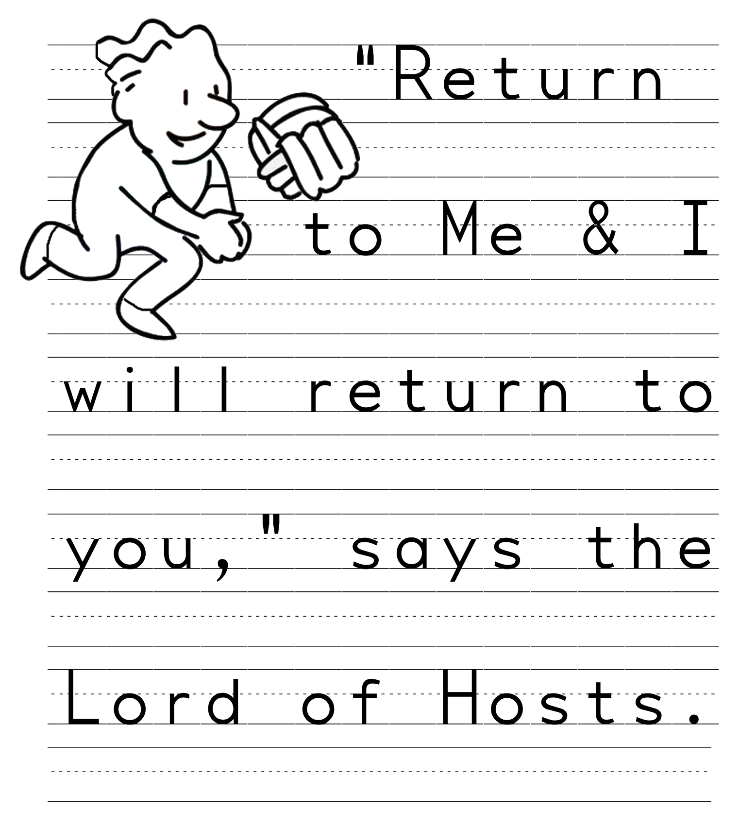
Memory Verse Copywork: Malachi 3:7